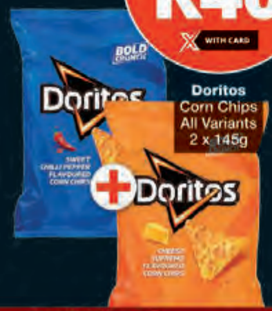
Doritos Corn Chips All Variants 2 x 145g