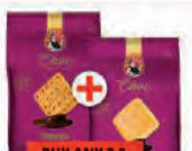
Bakers Jolly Jammers/Whirls/Zoo Biscuits 2 x 150g/200g