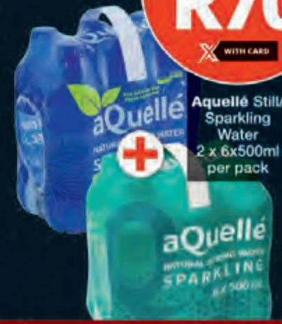
aQuelle Still/Sparkling Water 2 x 6x500ml per pack

GET UP TO 30% REAL CASH BACK* (absarewards) when paying with your Absa card. VALID FROM 1 FEBRUARY UNTIL 8 MARCH 2026. *Depending on your Rewards Tier. T&Cs apply.