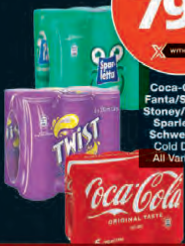
Coca-Cola/Fanta/Sprite/Stoney/Twist/Sparletta/Schweppes Cold Drink All Variants

SAVE 11% 79 99 (x200ml per pack) WITH CARD