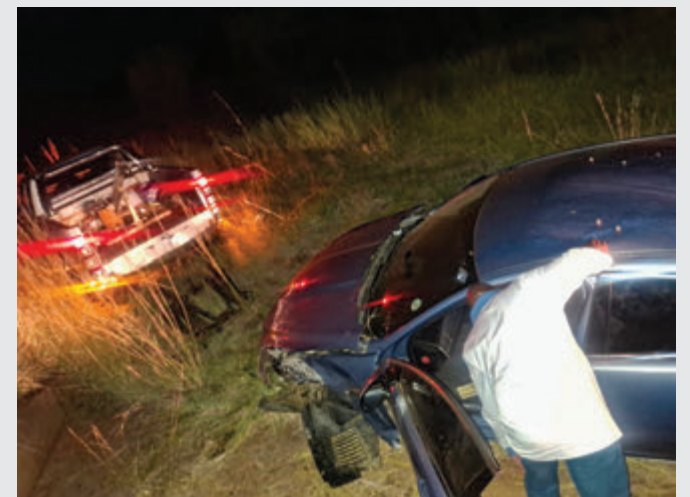
Emergency services responded to another vehicle rollover on the R510 late on Saturday night.

Just days later, at around 22:00, another vehicle overturned on the same stretch of the R510 (Lephalale Road). Two passengers sustained injuries in the crash. Emergency services responding to the scene included the Thabazimbi Police, state ambulance services and P&K Towing.