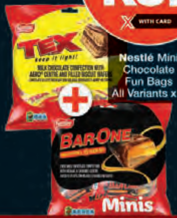
Nestlé Mini Chocolate Fun Bags All Variants x 2

SAVE 11% 79 99 (x200ml per pack) WITH CARD