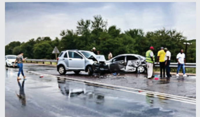
Authorities and emergency services on scene following a head-on collision near the Crocodile River Bridge.

At approximately 11:00 on Sunday morning, a head-on collision occurred on the R510 near the Crocodile River Bridge, close to the R511 T-junction. Emergency services responding to the scene included the Thabazimbi Police, state ambulance services and P&K Towing.