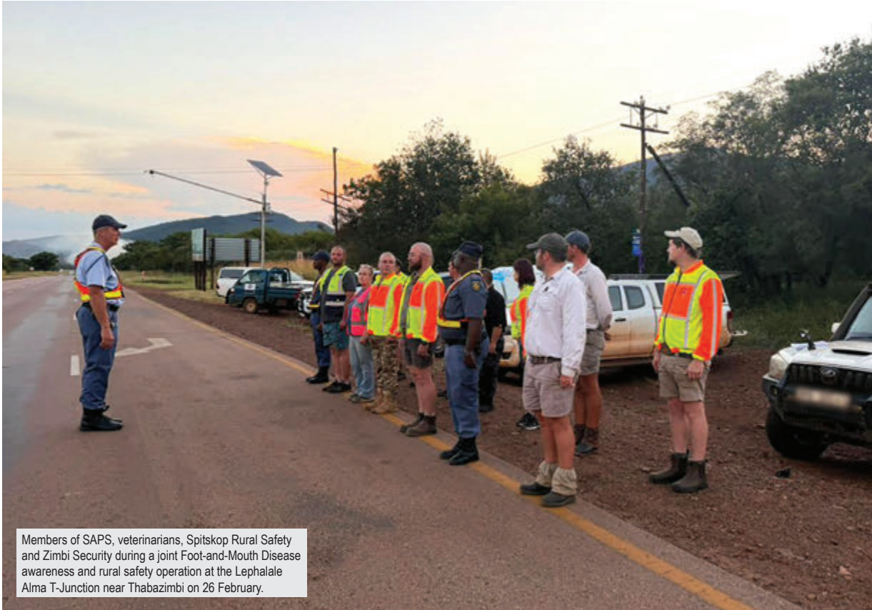
Members of SAPS, veterinarians, Spitskop Rural Safety and Zimbi Security during a joint Foot-and-Mouth Disease awareness and rural safety operation at the Lephalale Alma T-Junction near Thabazimbi on 26 February.