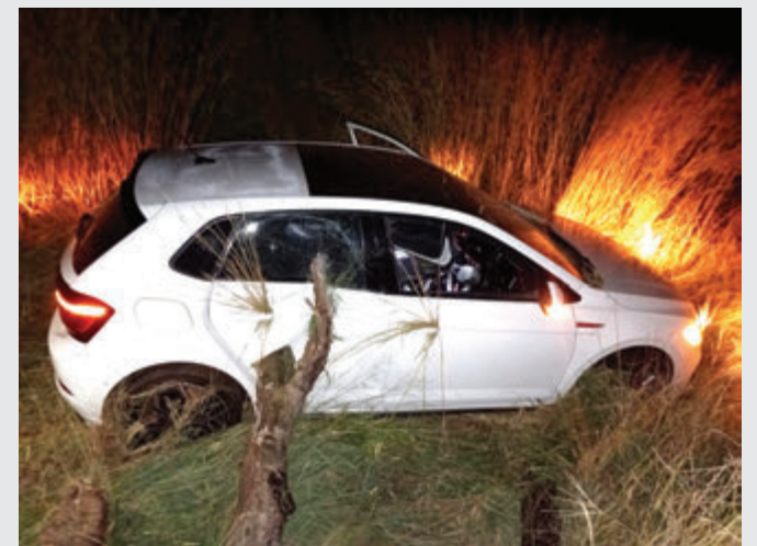
A vehicle that overturned along the R510 towards the Vaalwater T-junction.

At approximately 19:00, a vehicle overturned on the R510 (Lephalale Road) in the direction of the Vaalwater T-junction. The scene was attended by P&K Towing.